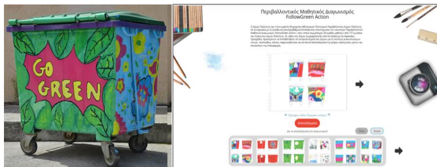
Figure 3: Painted bin (left) & Followgreen page illustrating schools' posts for online voting (right)