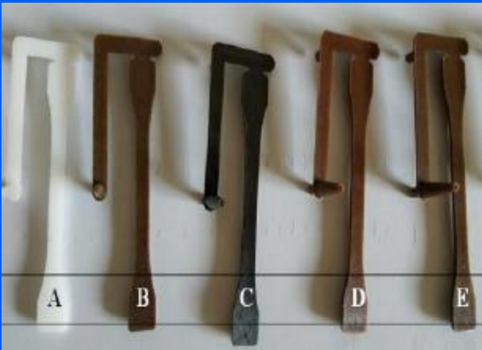
Figure 1: Biocomposite specimens. From left to right: (A) PBS (blank), (B) 10% grape stalk PBS (control), (C) 10% acetylated grape stalk PBS, (D) 10% silylated grape stalk PBS, and (E) 10% silylated in situ grape stalk PBS.

Grape stalks are lignocellulose biomass composed by three different bio-polymers: cellulose, hemicellulose, and lignin and represent a source of sugars, phenolic compounds, and fibre (Brandt et al, 2013). A possible use of grape stalk powder as filler for biodegradable composites (Seggiani et al, 2015; Cinelli et al, 2019; Nanni et al, 2019) is explored using poly-butylene succinate (PBS) as a base polymer. PBS is a thermoplastic polymer resin of the polyester family and degradable by some strains of Actinobacteria (Tokiwa et al, 2009).